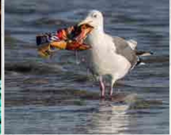
Photo courtesy of ( @flickr.com ) - granted under creative commons licence - attribution