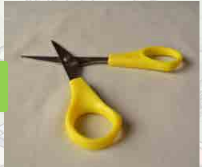
Photo courtesy of (@pixnio.com) - granted under creative commons licence - attribution