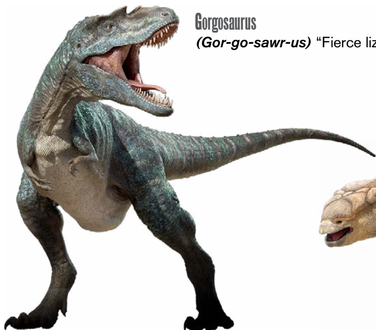
Gorgosaurus (Gor-go-sawr-us) "Fierce lizard"

Some dinosaurs walked on four legs, while others walked on two. Look at the difference in the shape of the front limbs in the pictures of the Gorgosaurus and Ankylosaur.