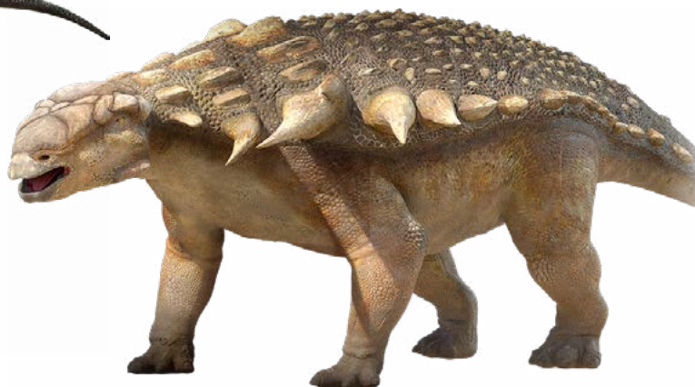
Ankylosaur (An-ky-lo-saur) "Fused lizard"

Like modern rhinos, dinosaurs sometimes had horn like features and some had armour-like plates, like the ankylosaur above. Horns on the head were for fighting, they were weapons. Bony plates made dinosaurs look fierce. They may have protected them from bites during battle. Some dinosaurs had spikes to fight off predatory meat eaters.