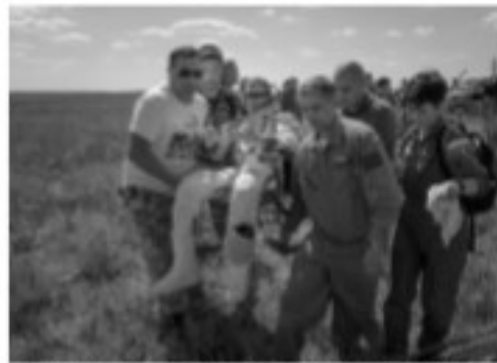
Landing with a bump! Tim Peake tests safety in Kazakhstan.

Having circled the planet nearly 3,000 times, the crew returned home to Earth in a capsule, which reached speeds of up to 28,000 kilometres per hour. The touchdown was bumpy due to high winds, however the astronauts landed safely in Kazakhstan, all returning in good health. Having arrived back on solid ground, the astronauts were pulled out of the capsule and carried as their leg muscles were too weak to walk. While sitting in their space suits, the men were checked over by medical staff. During these checks, Peake